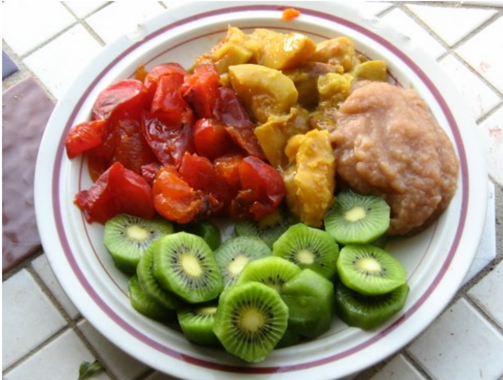
Breakfast platter of homegrown fruit, late December. Peaches, applesauce, persimmons, and kiwis. Yum!

When we give tours of LEF, we mention that one of our goals is to see how much food we can grow on trees. And that takes a while. But this year, we have definitely started to taste the benefits. Arboreal food production has the best drought resistance of any form of food production, zero soil erosion, builds soil and absorbs carbon from the atmosphere. This year we canned well over a hundred quarts of peaches and pear-apple sauce (with our Amish-made woodfired canner from DS Machine in PA). Our special Wintersweet pears had a good crop, and