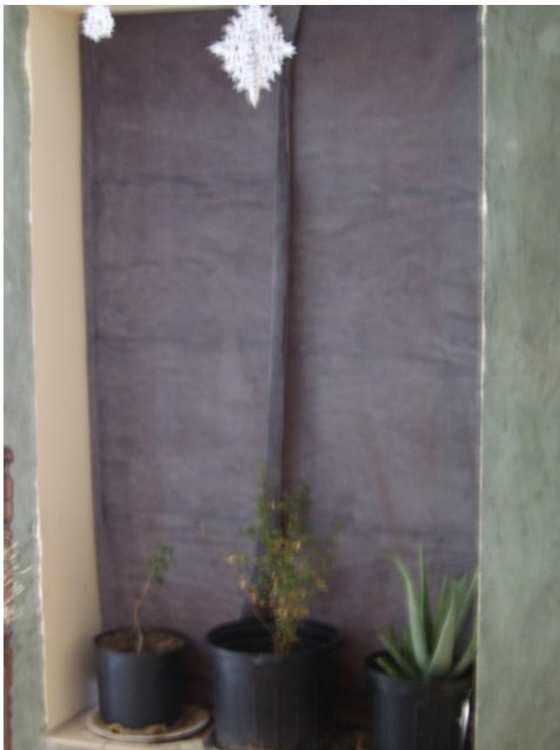
New thermal curtains at LEF, they save a huge amount of heat and look lovely too!

We have finished the final insulation touches on our solar hot water systems (thanks to Misha). We can take a hot shower even after several days of cloudy weather. Another improvement is the addition of thermal curtains in the main house. They make a BIG difference. On tours, we tell people that a normal double-pane windows can equal a super-quality windows that cost ten times as much if you just put a thermal curtain in front of the window at night. With our main living room, it has a lot of south-facing glass. Before the curtains, you could step into the room and feel the heat loss in the morning. Misha and Deanna made some great curtains that are as lovely as they are functional. The difference is striking. The living room is noticeably warmer on a cold winter morning. Their design is at kumeproject.com